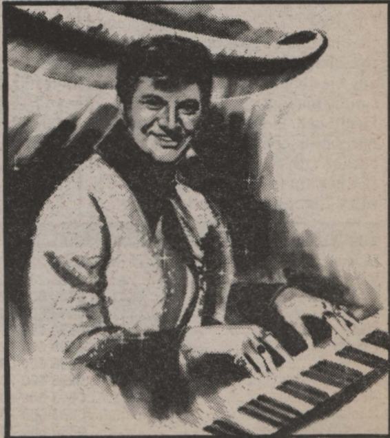
Glowing strong ... the luminous Liberace